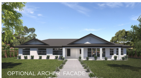
OPTIONAL ARCHER FACADE