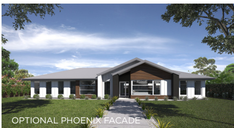
OPTIONAL PHOENIX FACADE