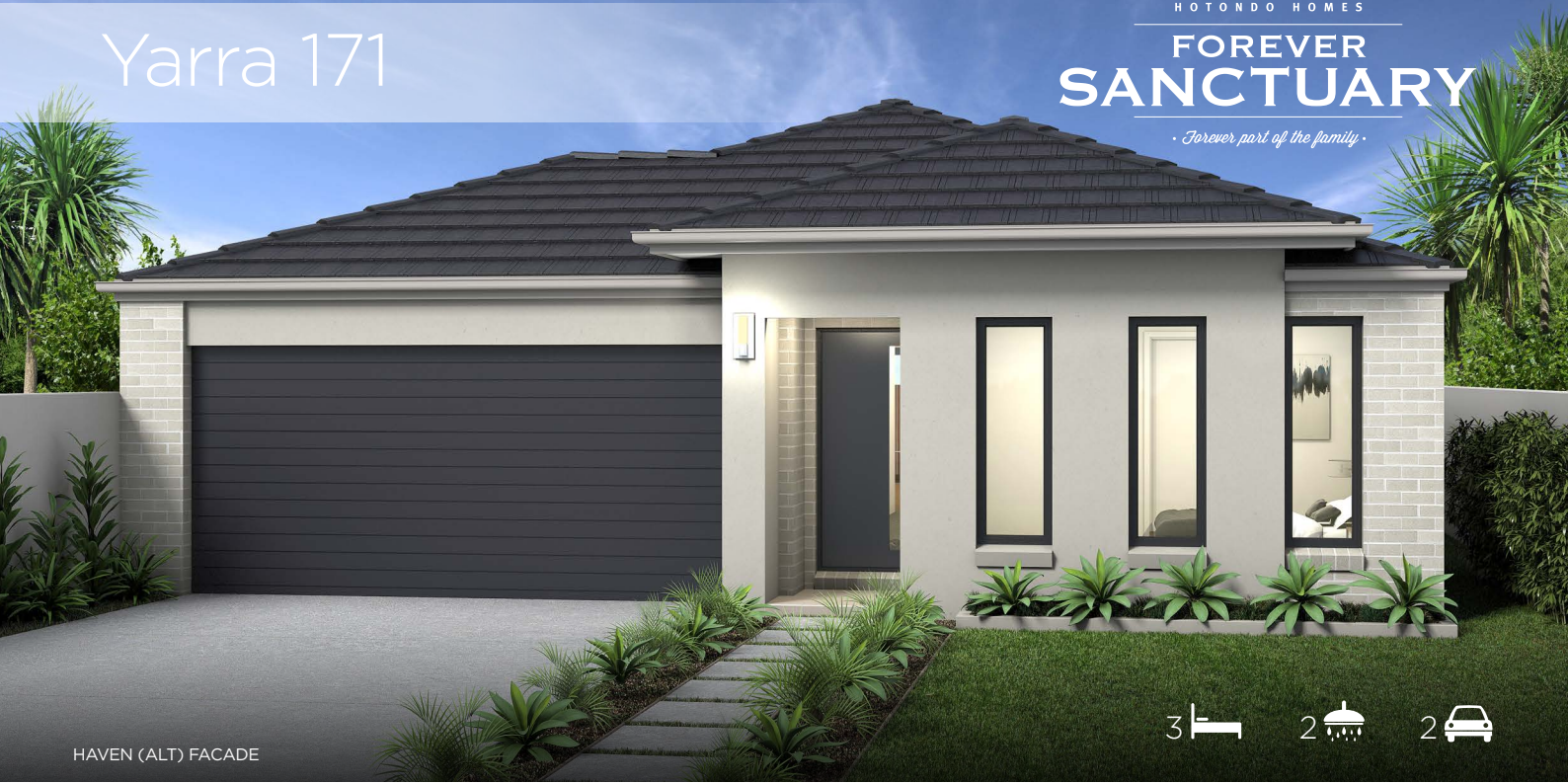
HAVEN (ALT) FACADE