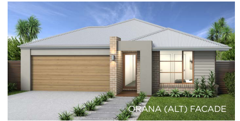
ORANA (ALT) FACADE