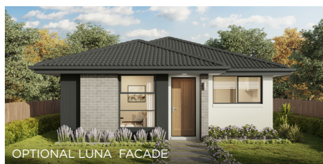
OPTIONAL LUNA FACADE