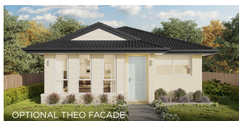
OPTIONAL THEO FACADE