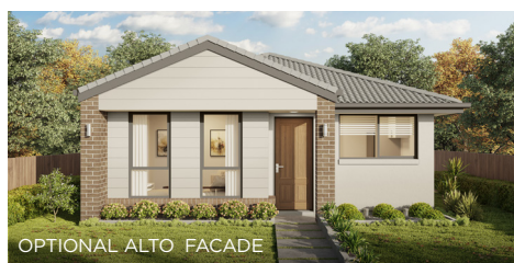
OPTIONAL ALTO FACADE