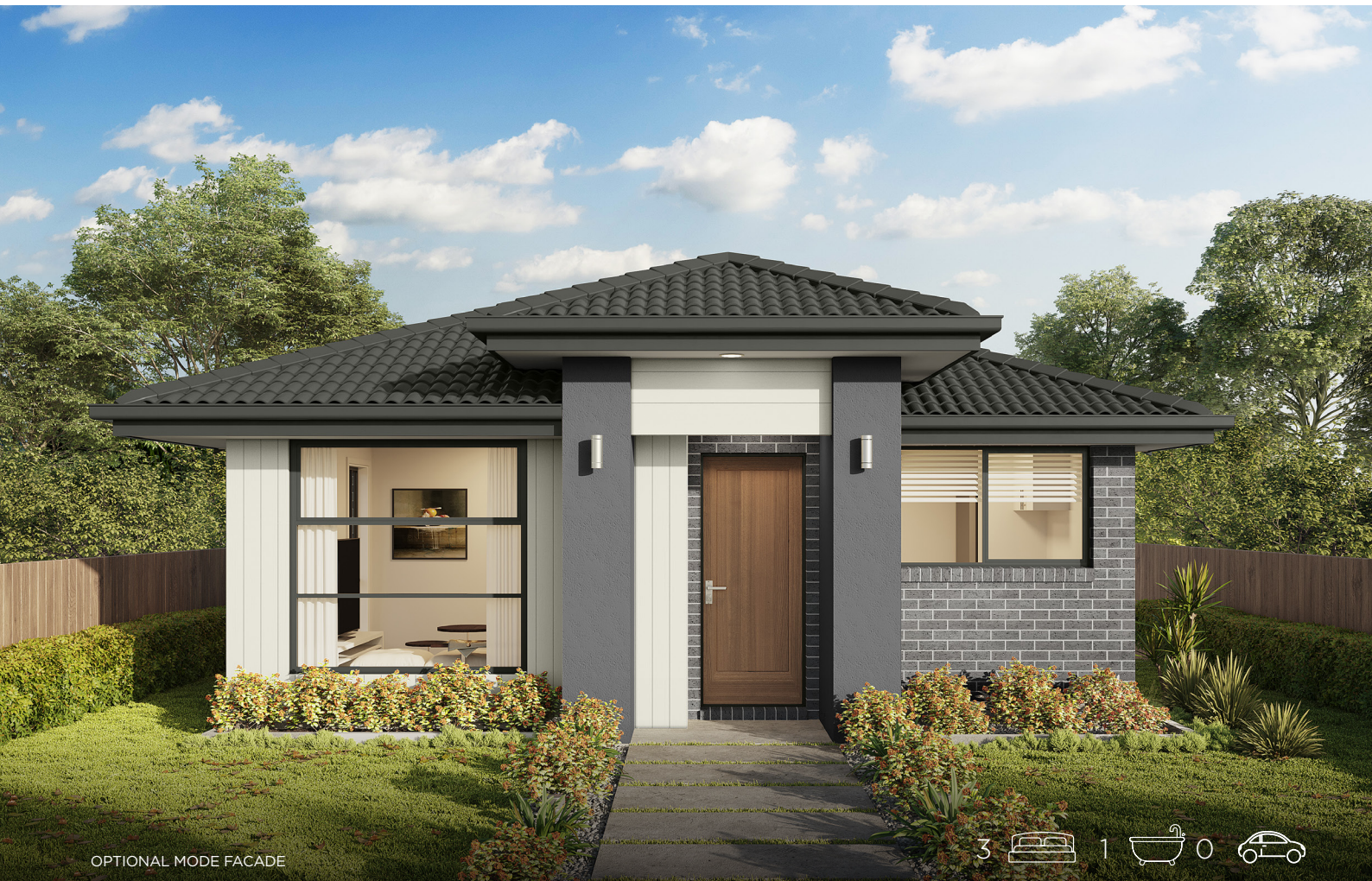
OPTIONAL MODE FACADE