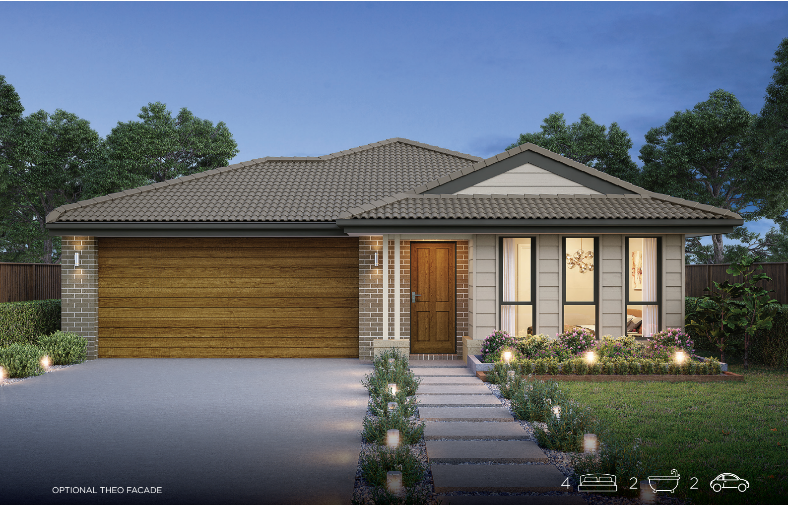
OPTIONAL THEO FACADE