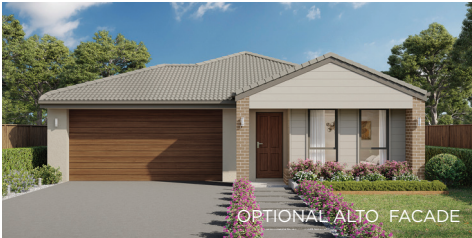
OPTIONAL ALTO FACADE