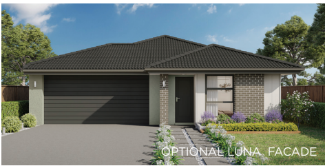
OPTIONAL LUNA FACADE