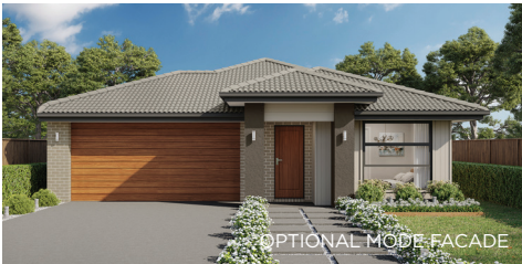
OPTIONAL MODE FACADE