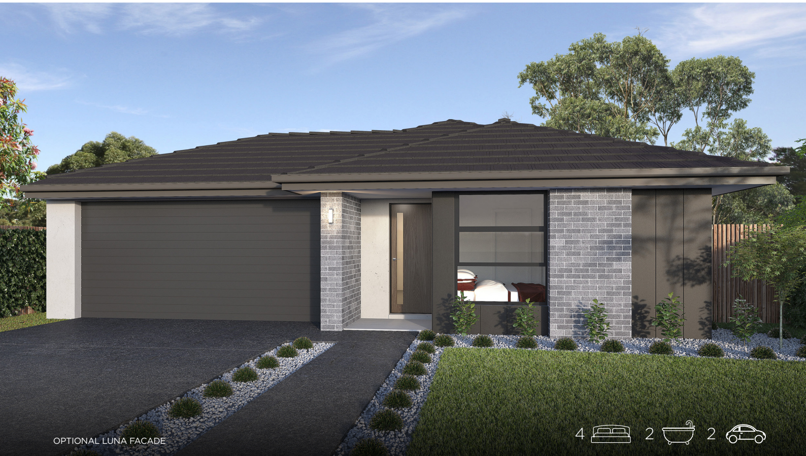
OPTIONAL LUNA FACADE