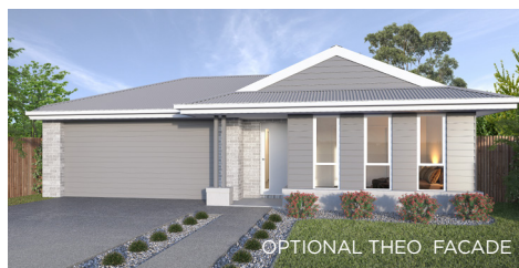
OPTIONAL THEO FACADE