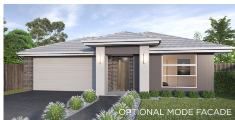
OPTIONAL MODE FACADE