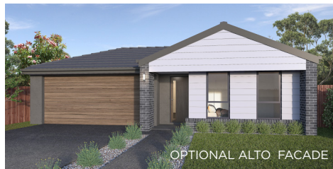
OPTIONAL ALTO FACADE