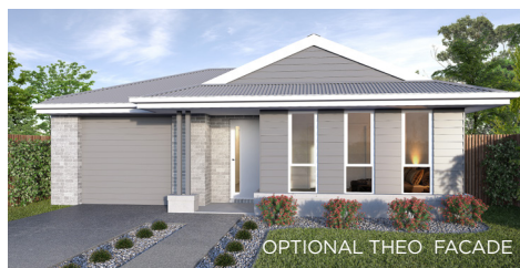
OPTIONAL THEO FACADE