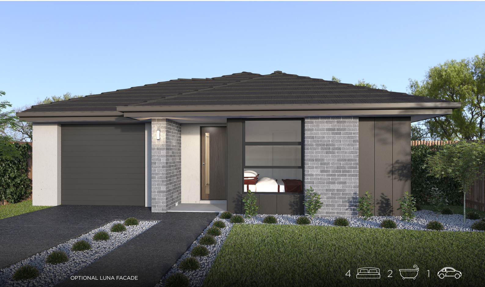
OPTIONAL LUNA FACADE