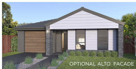
OPTIONAL ALTO FACADE