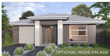
OPTIONAL MODE FACADE