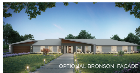
OPTIONAL BRONSON FACADE