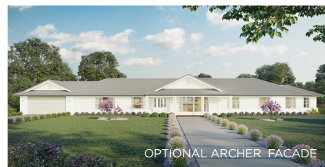
OPTIONAL ARCHER FACADE