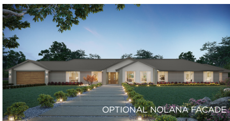
OPTIONAL NOLANA FACADE