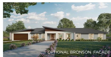
OPTIONAL BRONSON FACADE