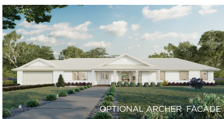
OPTIONAL ARCHER FACADE