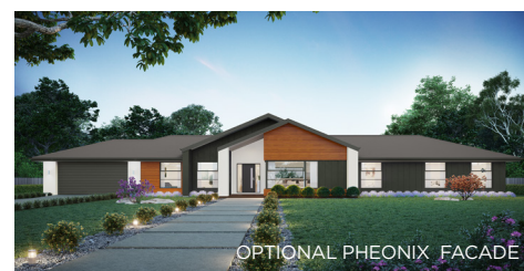
OPTIONAL PHEONIX FACADE