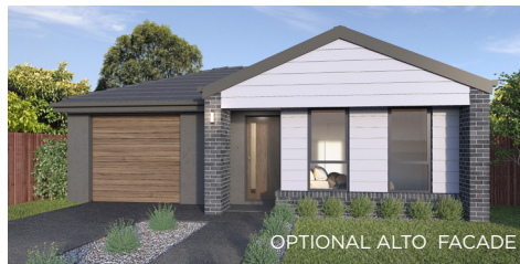
OPTIONAL ALTO FACADE