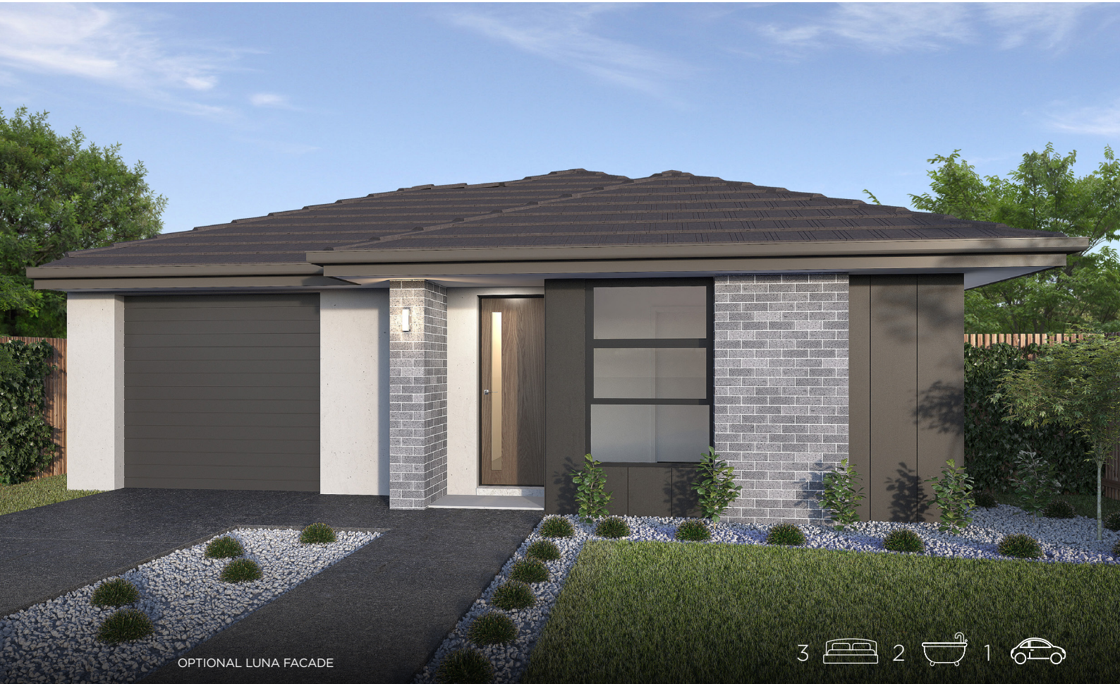
OPTIONAL LUNA FACADE