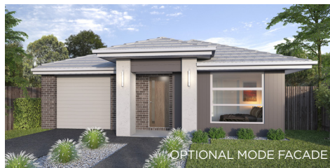
OPTIONAL MODE FACADE