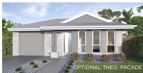
OPTIONAL THEO FACADE