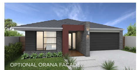
OPTIONAL ORANA FACADE