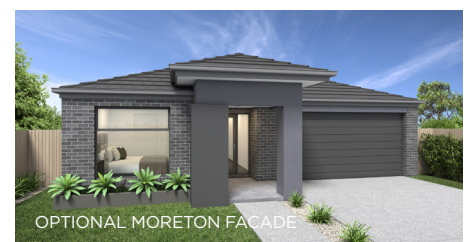
OPTIONAL MORETON FACADE