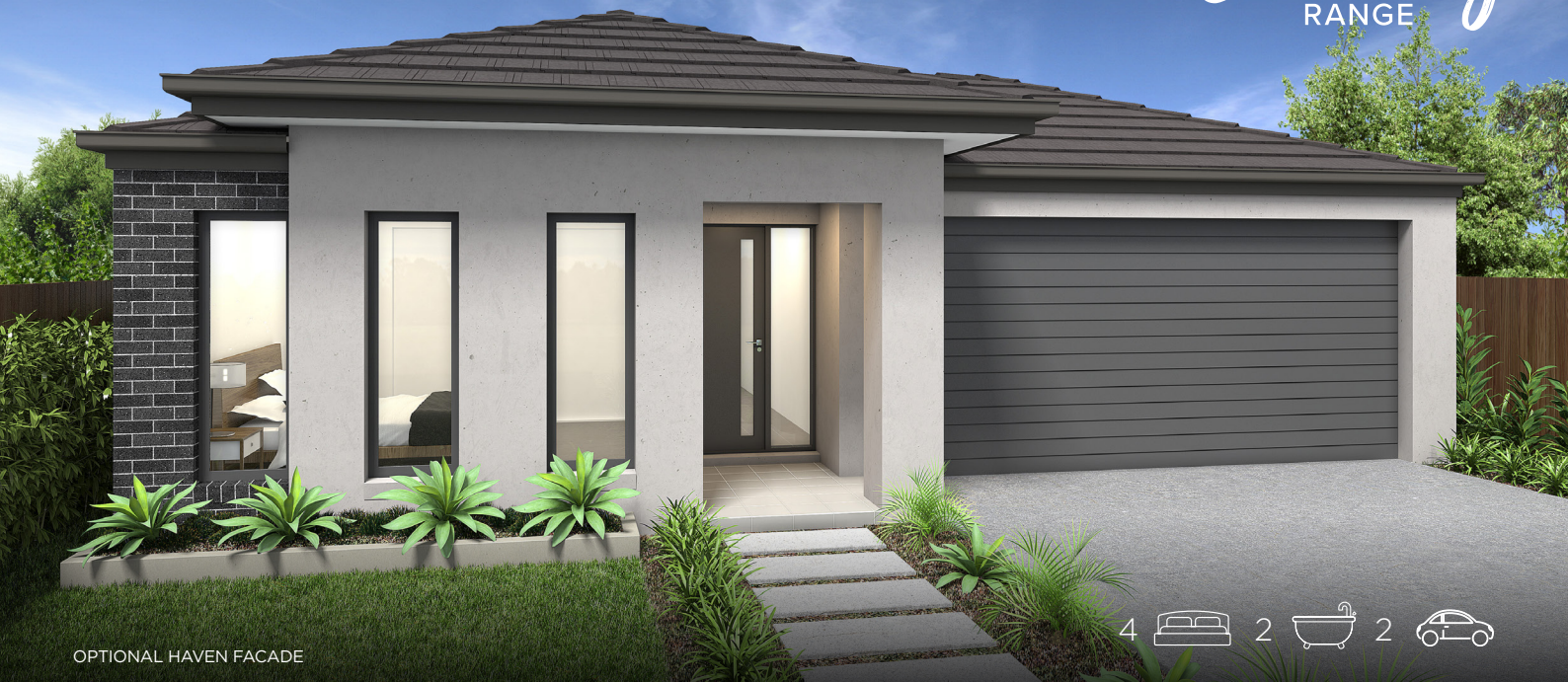
OPTIONAL HAVEN FACADE