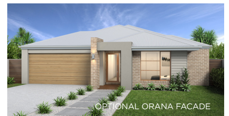
OPTIONAL ORANA FACADE