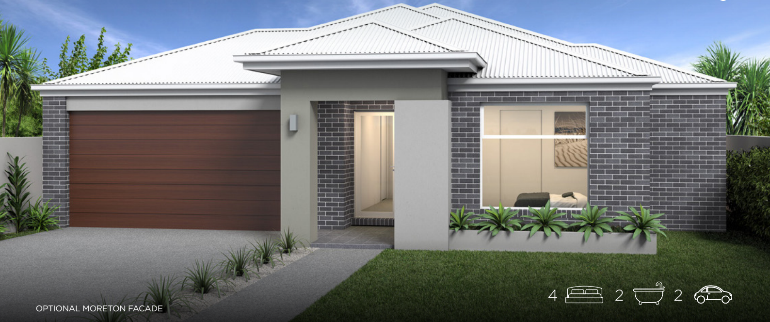
OPTIONAL MORETON FACADE