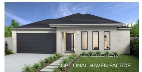
OPTIONAL HAVEN FACADE