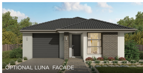
OPTIONAL LUNA FACADE