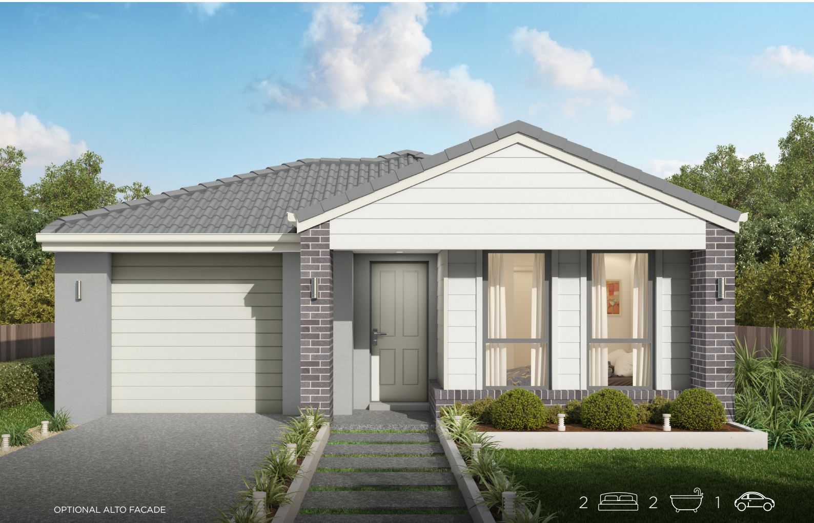
OPTIONAL ALTO FACADE