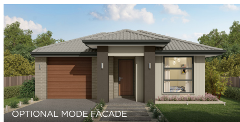
OPTIONAL MODE FACADE