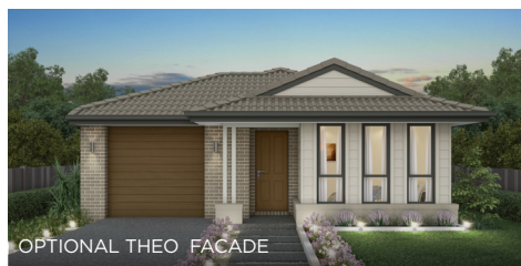
OPTIONAL THEO FACADE