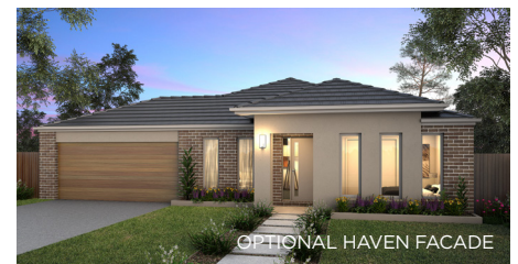
OPTIONAL HAVEN FACADE