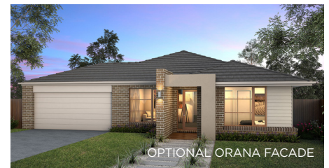
OPTIONAL ORANA FACADE