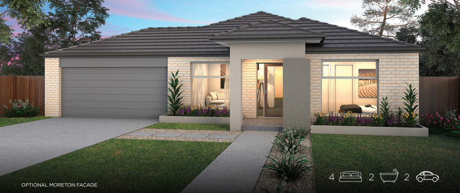
OPTIONAL MORETON FACADE