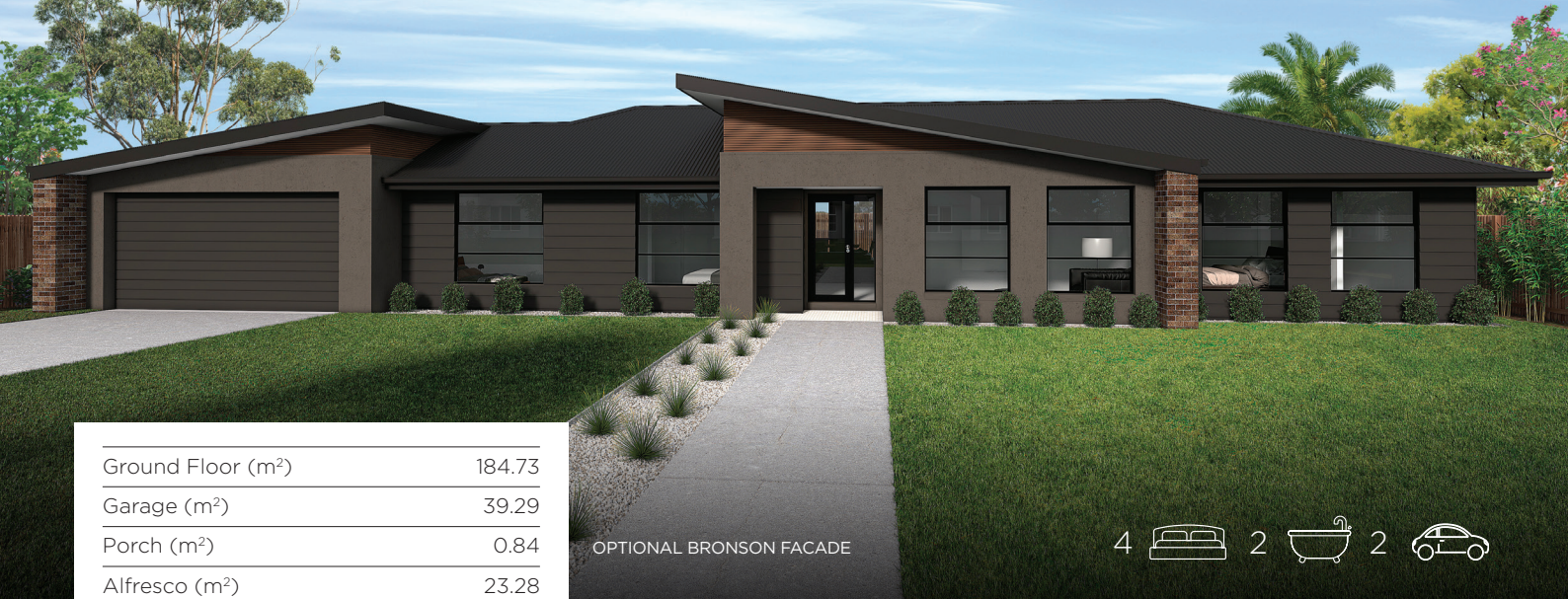
OPTIONAL BRONSON FACADE