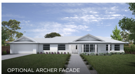
OPTIONAL ARCHER FACADE