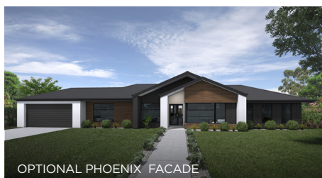
OPTIONAL PHOENIX FACADE