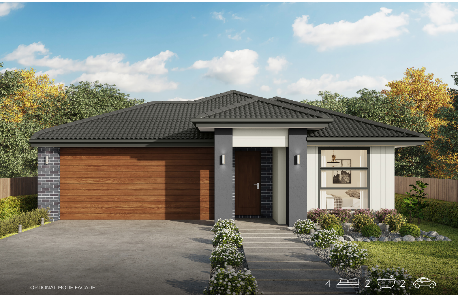
OPTIONAL MODE FACADE