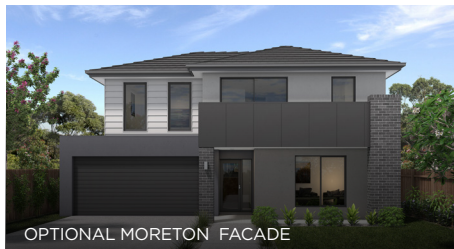
OPTIONAL MORETON FACADE