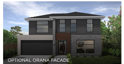
OPTIONAL ORANA FACADE