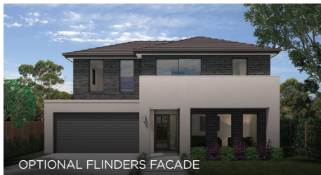
OPTIONAL FLINDERS FACADE