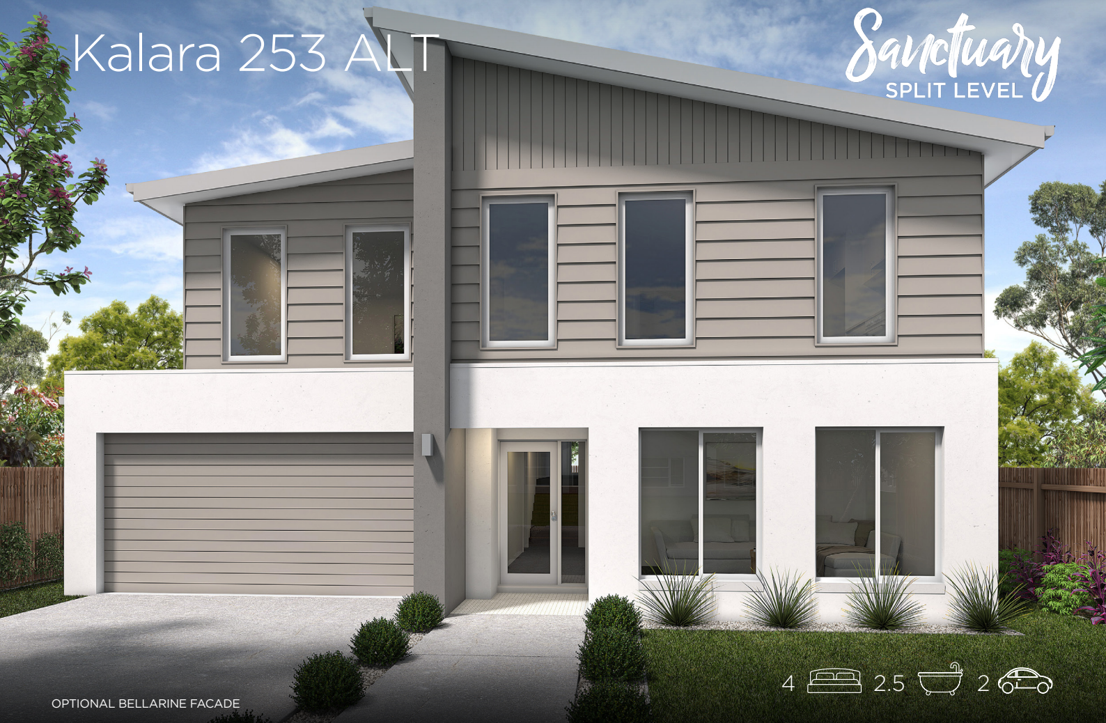
OPTIONAL BELLARINE FACADE