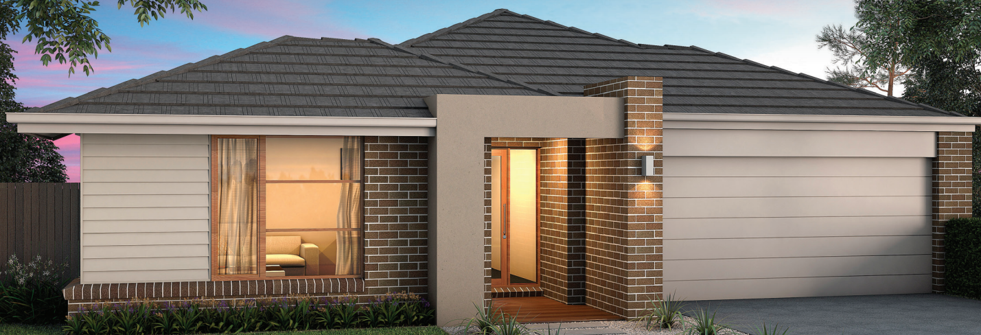
OPTIONAL ORANA FACADE