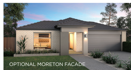
OPTIONAL MORETON FACADE