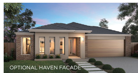
OPTIONAL HAVEN FACADE