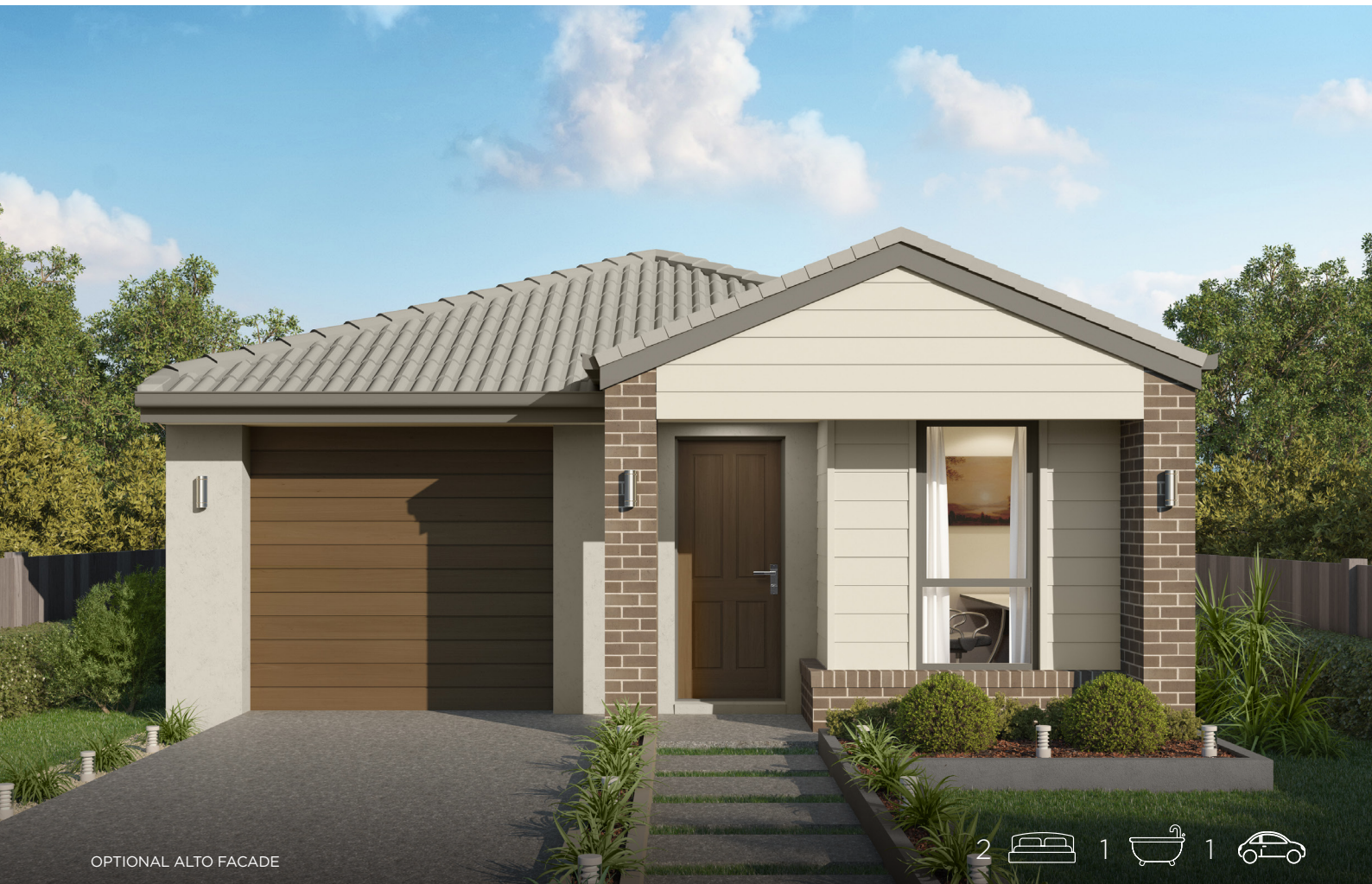
OPTIONAL ALTO FACADE