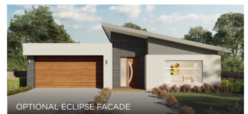
OPTIONAL ECLIPSE FACADE