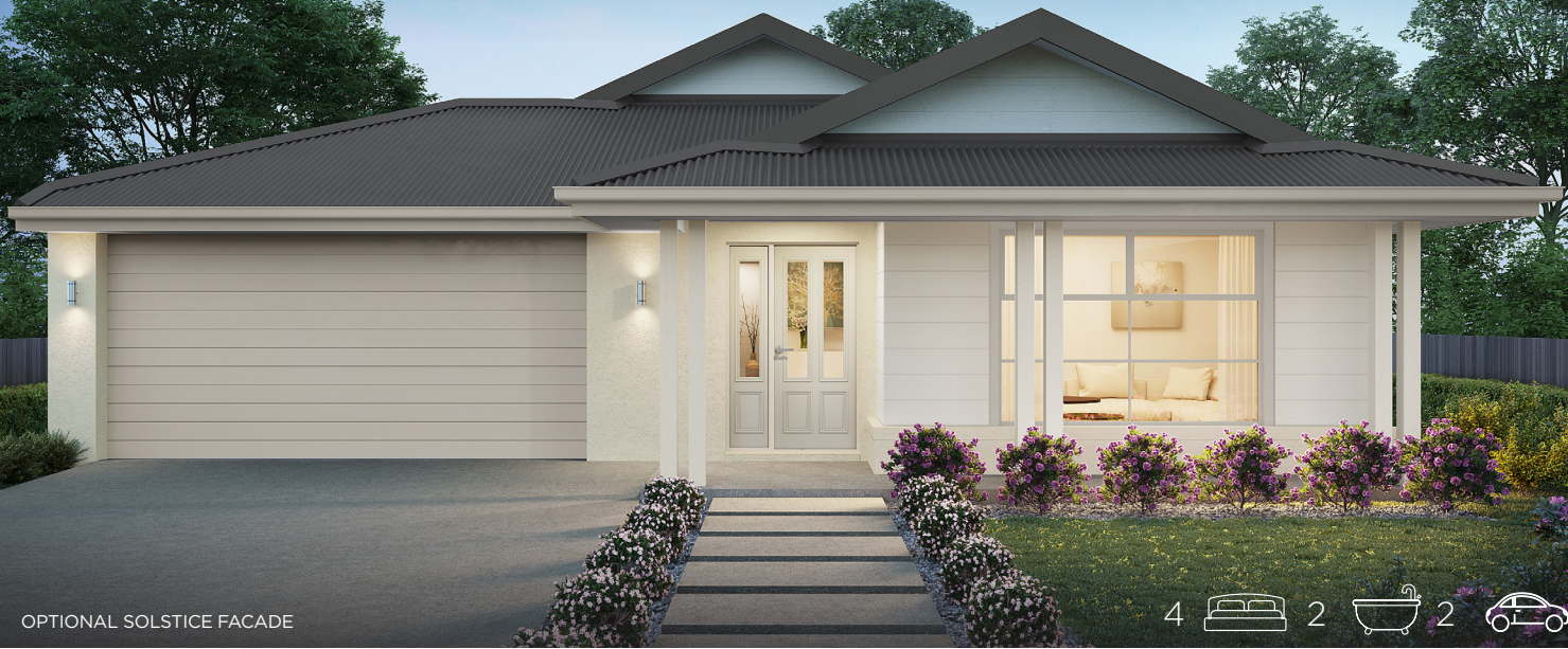
OPTIONAL SOLSTICE FACADE