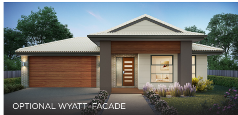
OPTIONAL WYATT FACADE