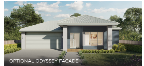
OPTIONAL ODYSSEY FACADE