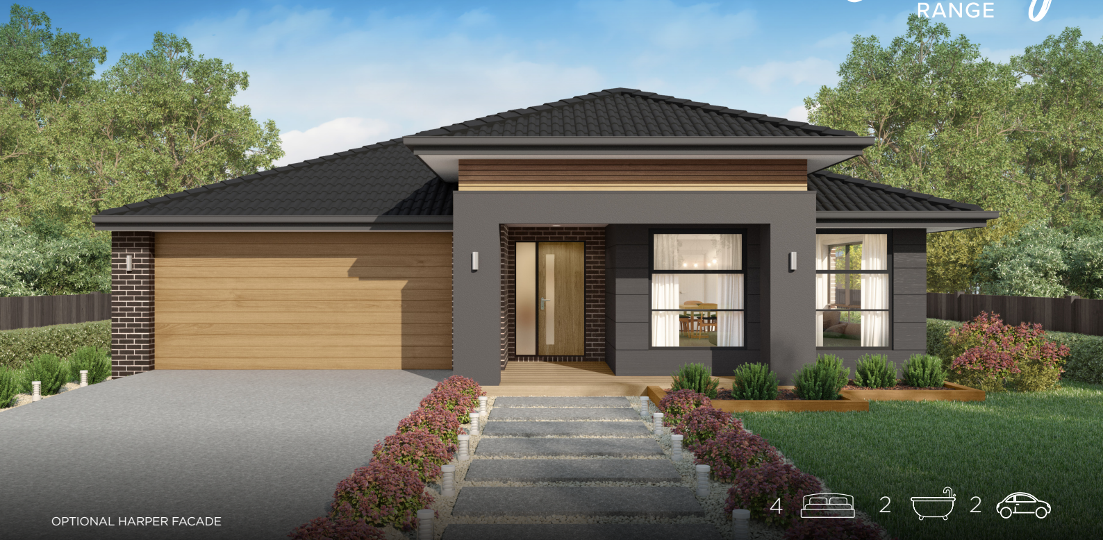
OPTIONAL HARPER FACADE