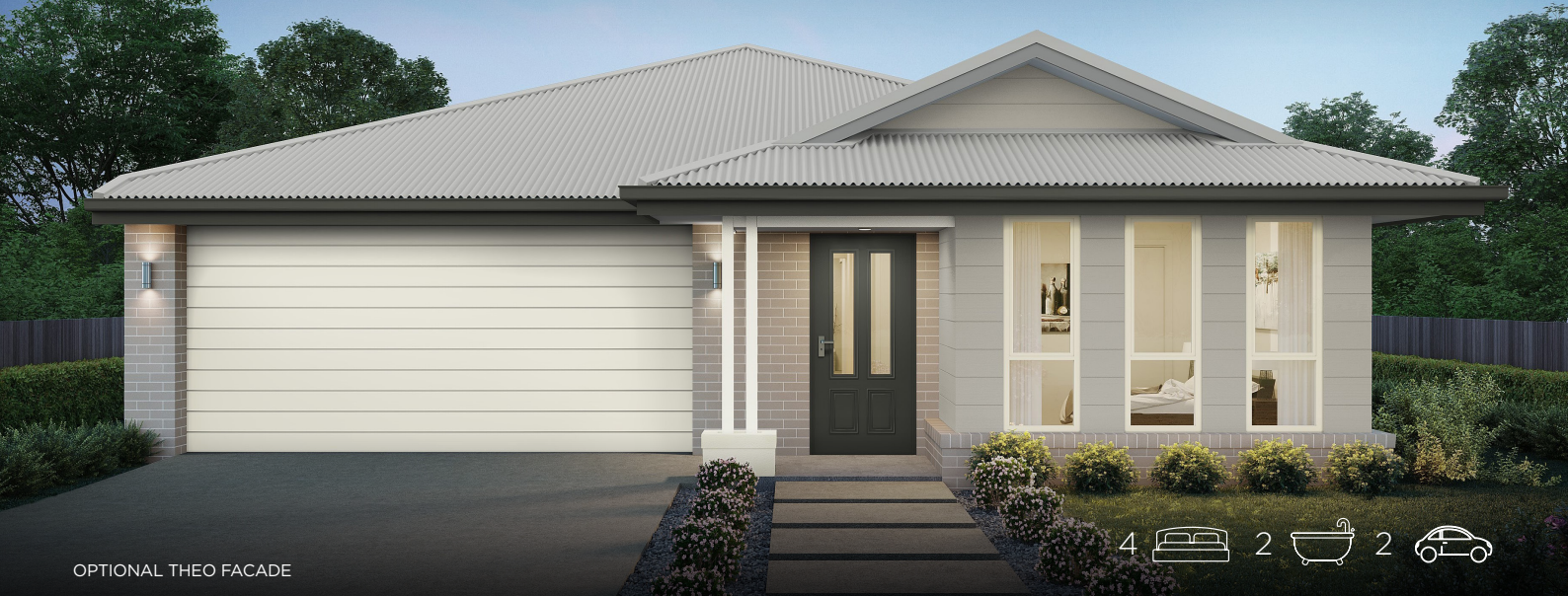
OPTIONAL THEO FACADE