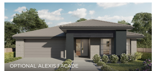
OPTIONAL ALEXIS FACADE