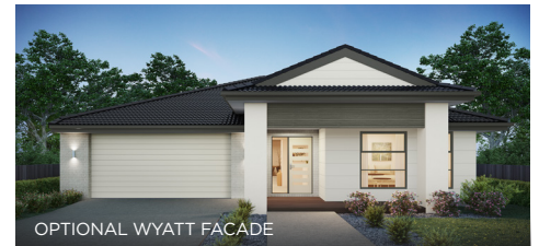
OPTIONAL WYATT FACADE