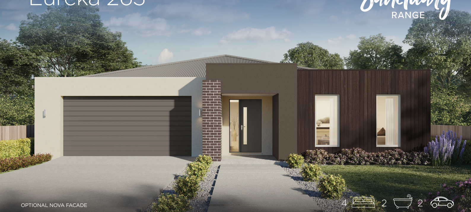
OPTIONAL NOVA FACADE