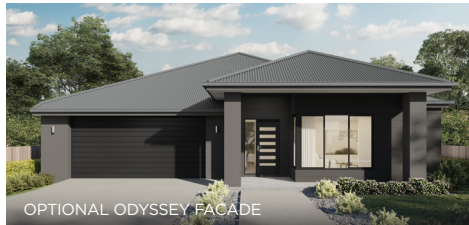
OPTIONAL ODYSSEY FACADE