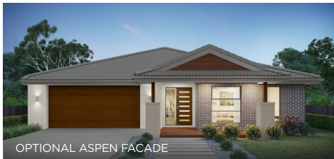
OPTIONAL ASPEN FACADE