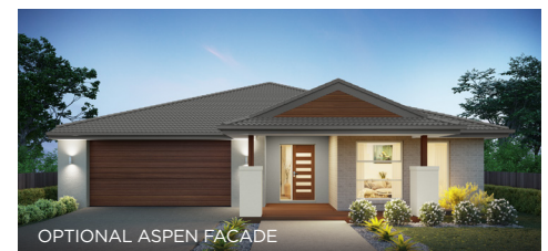
OPTIONAL ASPEN FACADE