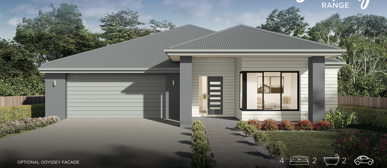
OPTIONAL ODYSSEY FACADE