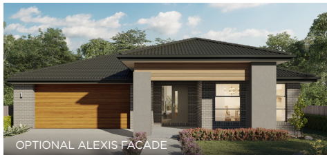
OPTIONAL ALEXIS FACADE