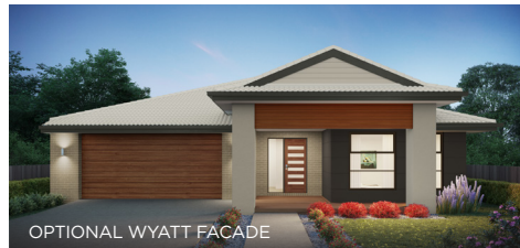
OPTIONAL WYATT FACADE