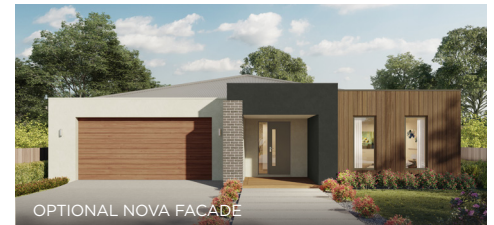
OPTIONAL NOVA FACADE