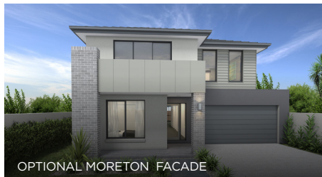
OPTIONAL MORETON FACADE