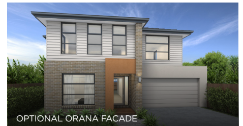
OPTIONAL ORANA FACADE