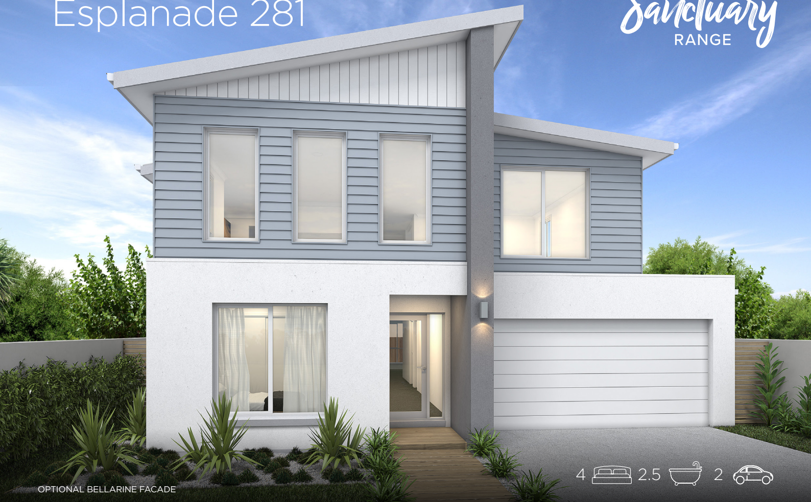
OPTIONAL BELLARINE FACADE