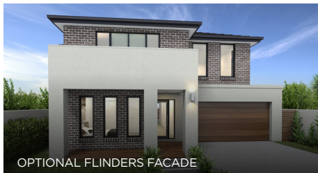
OPTIONAL FLINDERS FACADE