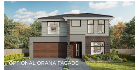
OPTIONAL ORANA FACADE