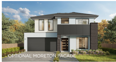
OPTIONAL MORETON FACADE