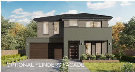
OPTIONAL FLINDERS FACADE