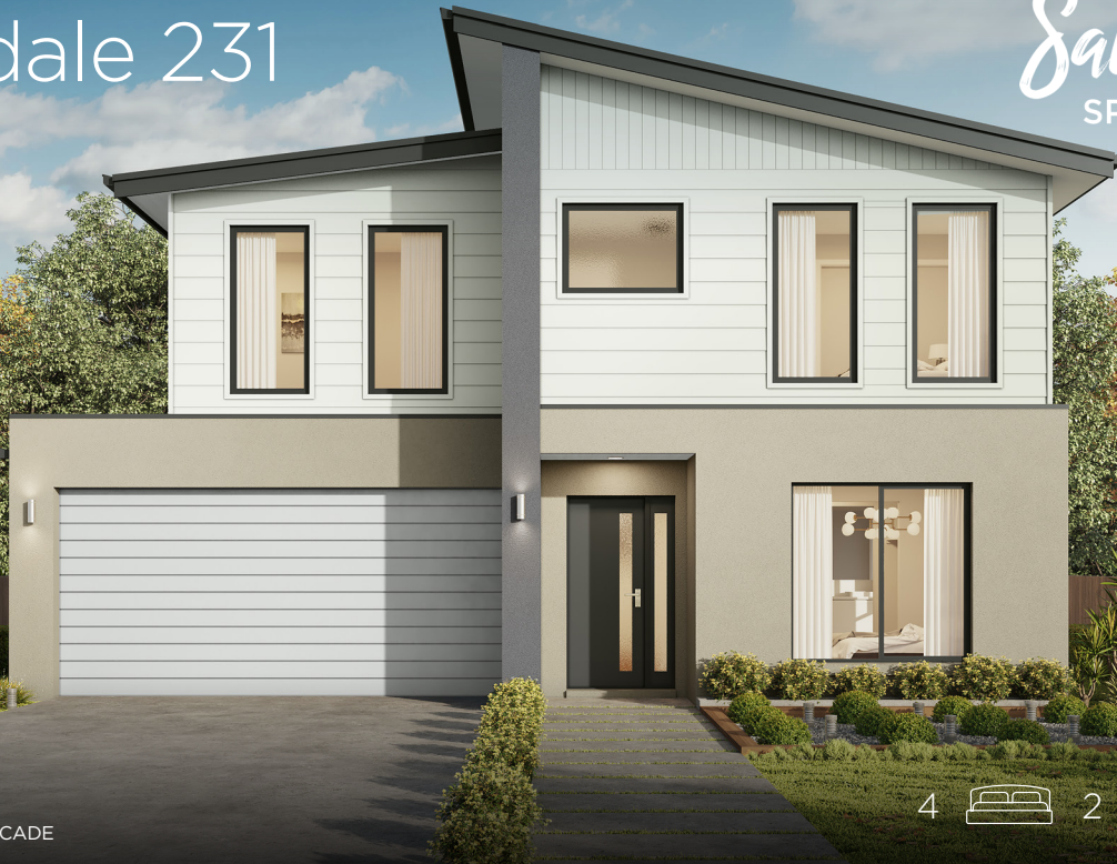
OPTIONAL BELLARINE FACADE