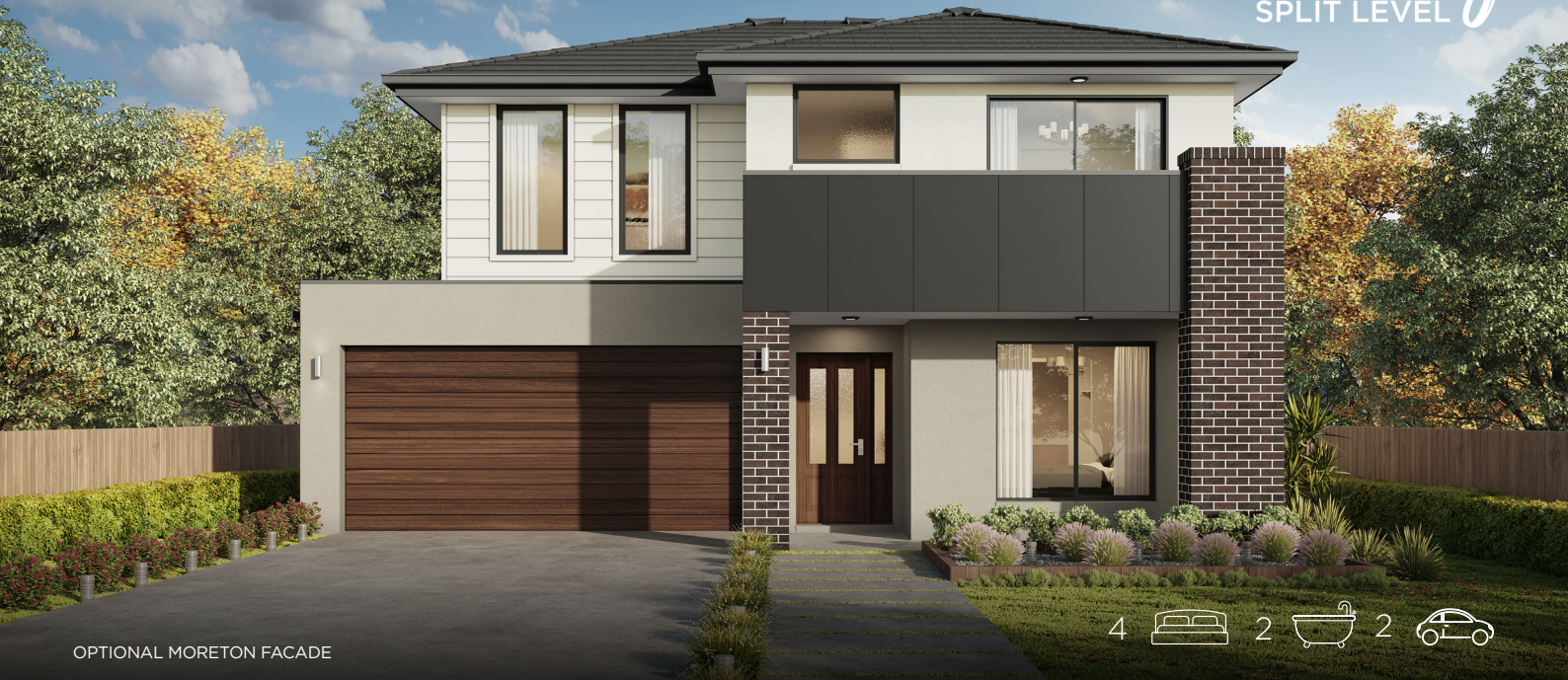
OPTIONAL MORETON FACADE