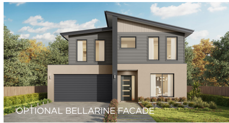
OPTIONAL BELLARINE FACADE