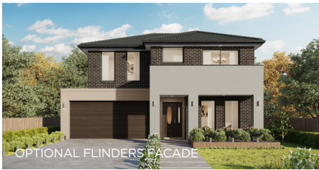
OPTIONAL FLINDERS FACADE