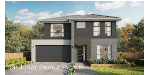
OPTIONAL ORANA FACADE