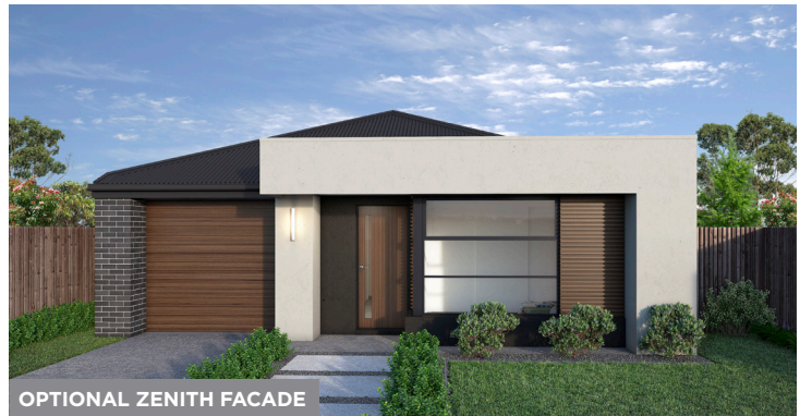
OPTIONAL ZENITH FACADE