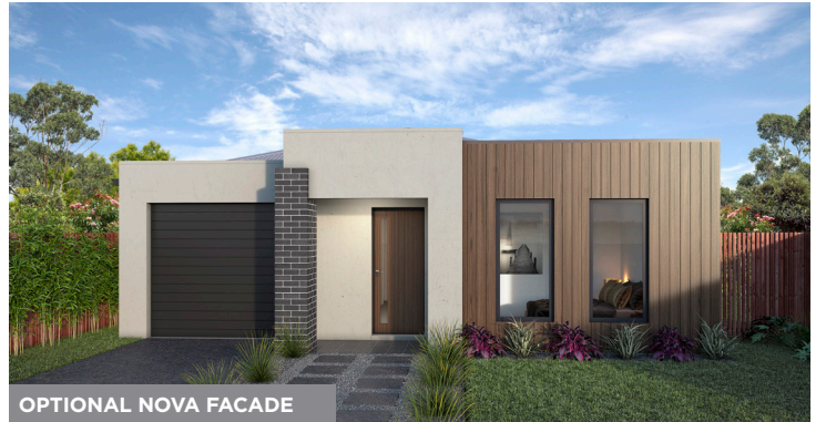
OPTIONAL NOVA FACADE