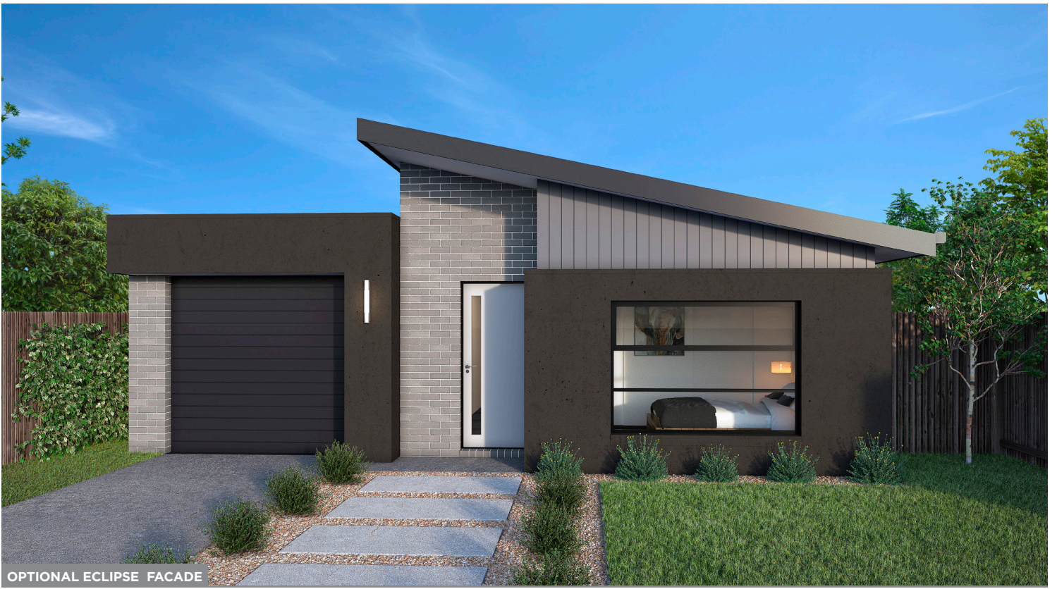
OPTIONAL ECLIPSE FACADE