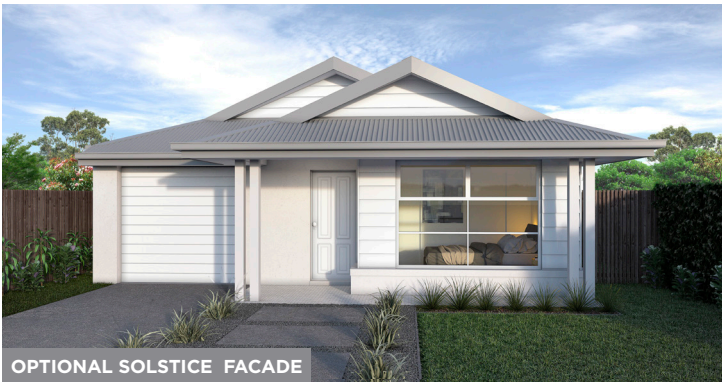
OPTIONAL SOLSTICE FACADE