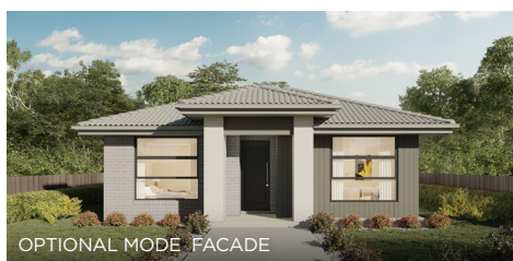
OPTIONAL MODE FACADE