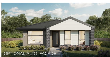
OPTIONAL ALTO FACADE