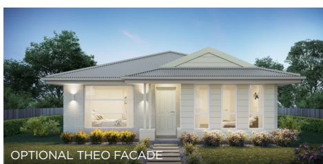
OPTIONAL THEO FACADE