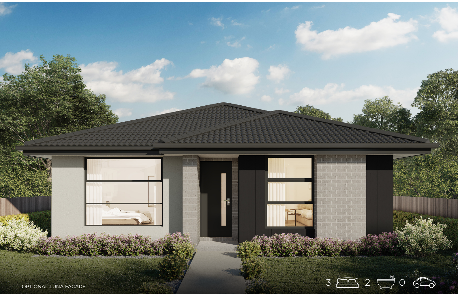
OPTIONAL LUNA FACADE