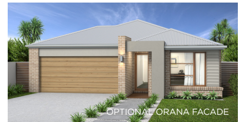
OPTIONAL ORANA FACADE