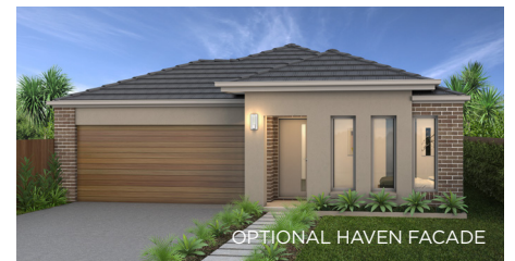
OPTIONAL HAVEN FACADE