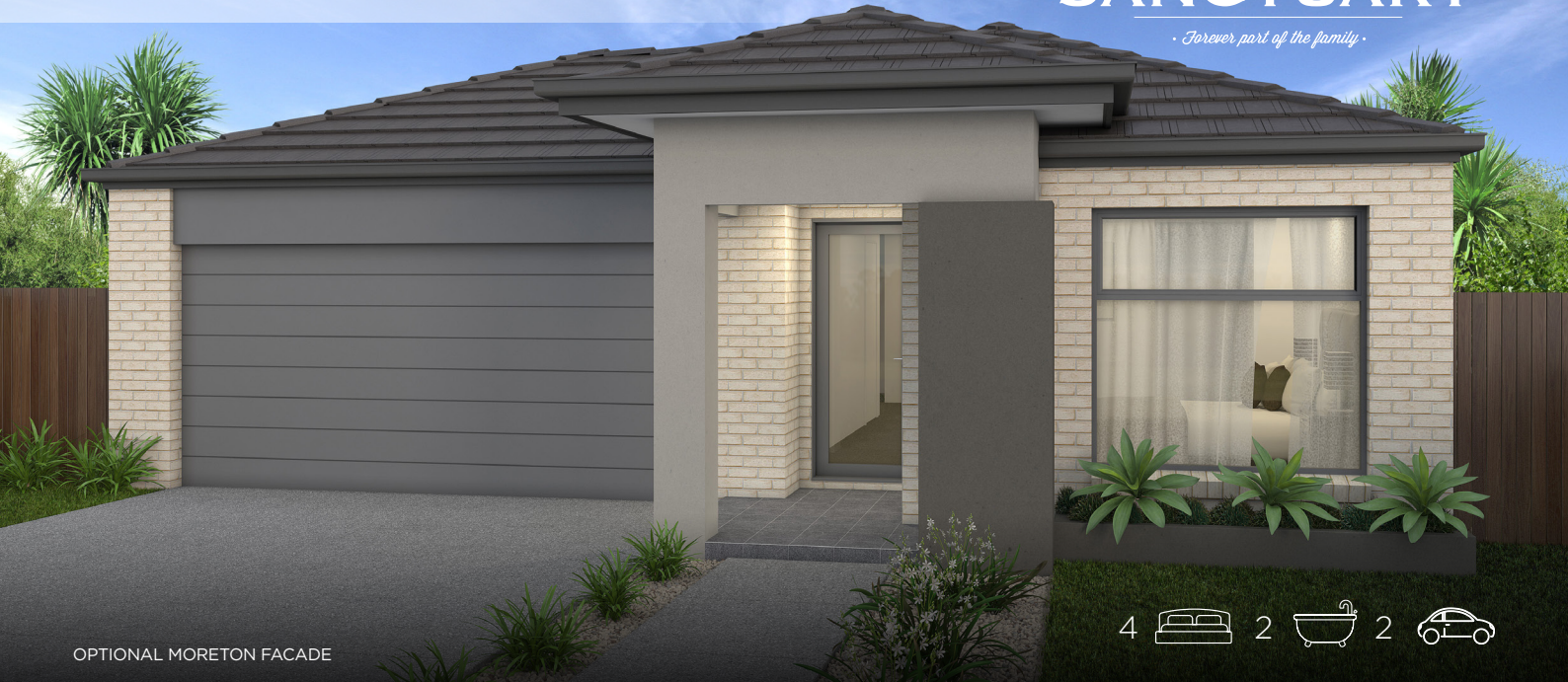
OPTIONAL MORETON FACADE