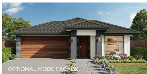
OPTIONAL MODE FACADE