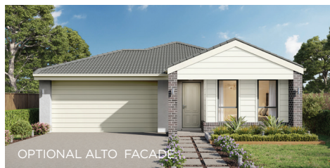
OPTIONAL ALTO FACADE