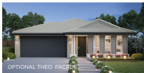
OPTIONAL THEO FACADE