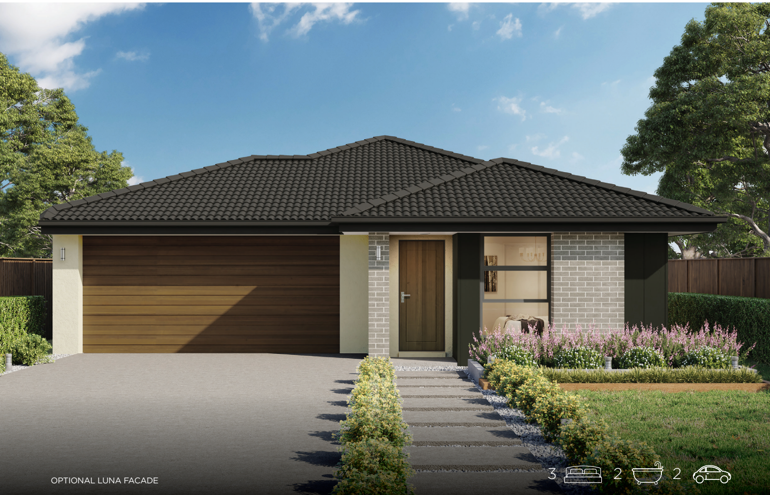
OPTIONAL LUNA FACADE