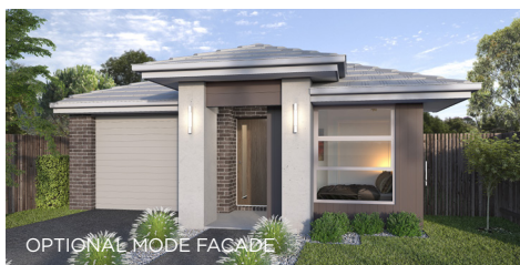
OPTIONAL MODE FACADE