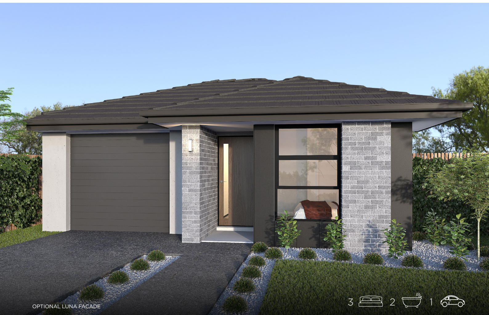
OPTIONAL LUNA FACADE