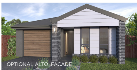
OPTIONAL ALTO FACADE