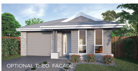
OPTIONAL THEO FACADE