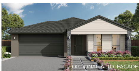
OPTIONAL ALTO FACADE