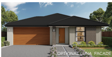
OPTIONAL LUNA FACADE