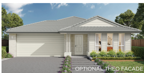
OPTIONAL THEO FACADE