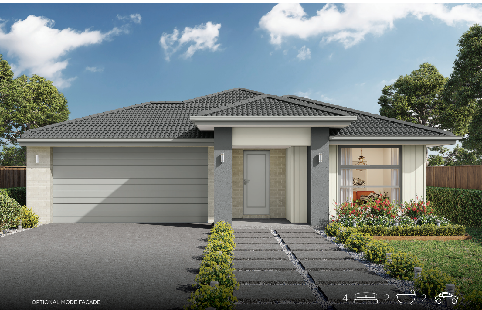
OPTIONAL MODE FACADE