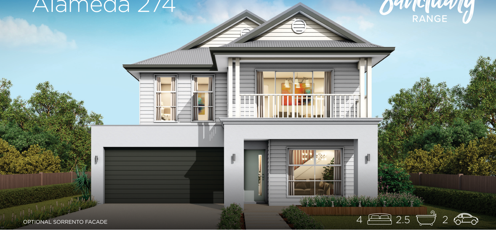
OPTIONAL SORRENTO FACADE