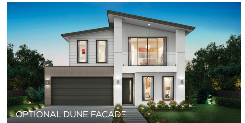
OPTIONAL DUNE FACADE