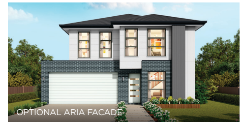
OPTIONAL ARIA FACADE