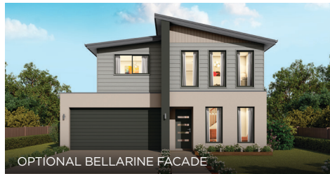
OPTIONAL BELLARINE FACADE