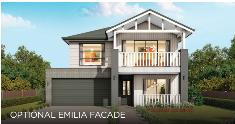
OPTIONAL EMILIA FACADE