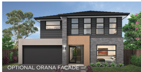
OPTIONAL ORANA FACADE