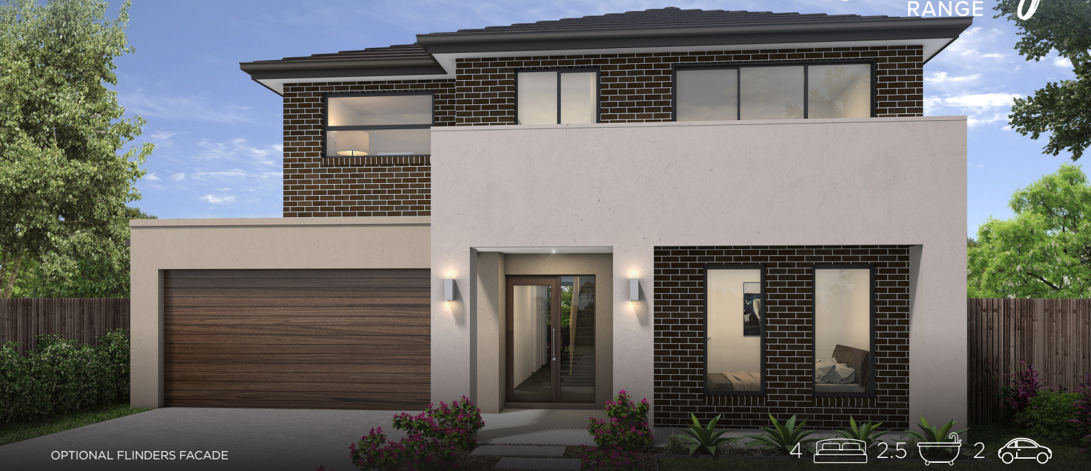
OPTIONAL FLINDERS FACADE