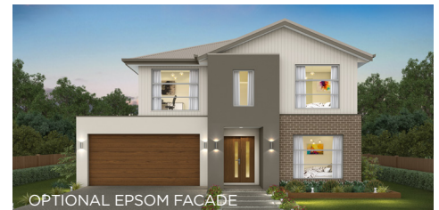
OPTIONAL EPSOM FACADE