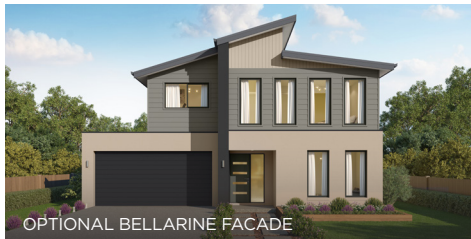
OPTIONAL BELLARINE FACADE