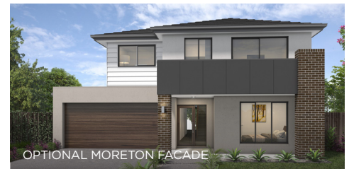
OPTIONAL MORETON FACADE